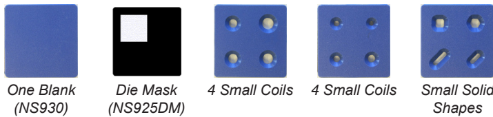
One Blank (NS930) Die Mask (NS925DM) 4 Small Coils 4 Small Coils Small Solid Shapes